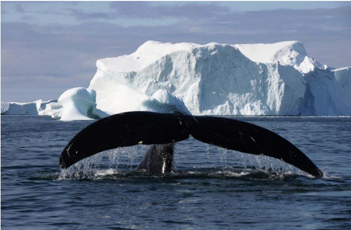
Bowhead whale, Disko Bay, Greenland