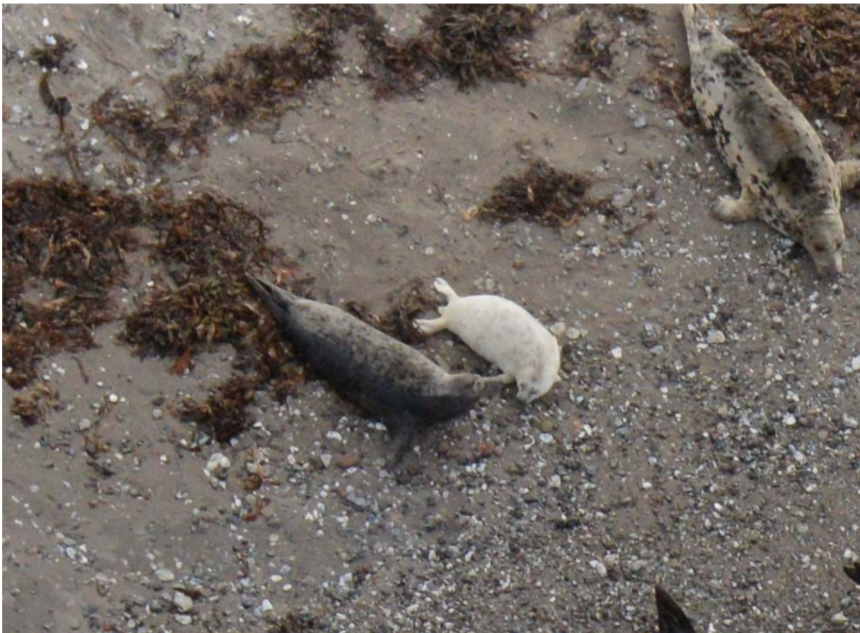
Harbour seal investigating grey seal pup