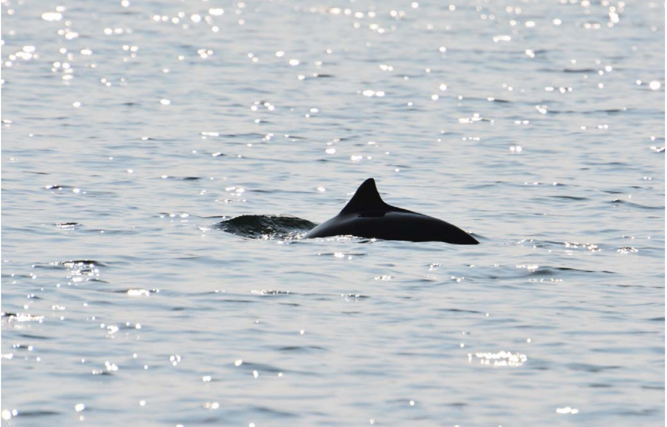
Harbour porpoise near Middelfart.