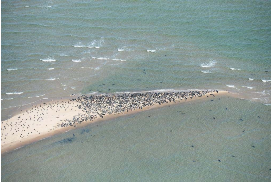
Grey seals and harbour seals